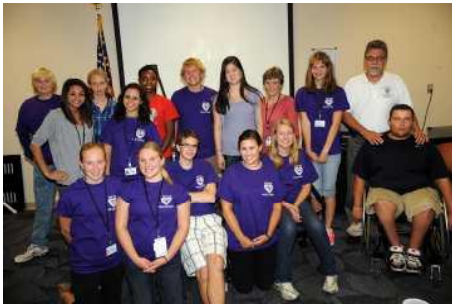
2011 MOPH Youth/Student Volunteers Minneapolis VA Medical Center