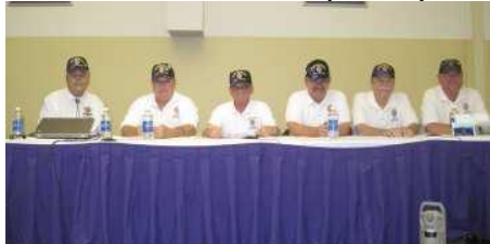
The Chapter 5555 Vietnam War Presenters in Action